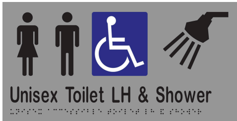
Unisex Accessible Toilet LH & Shower Braille