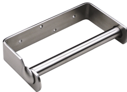
Single Toilet Roll Holder Code: 113_TRH_SS