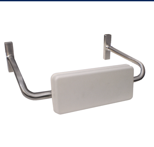
Straight Rail Padded Toilet Backrest Code: MLR119MKII