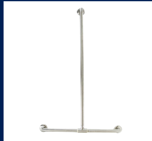
Universal Sliding Shower Rail Code: MLR1078_SS