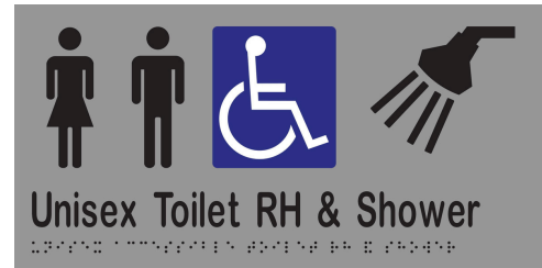
Unisex Accessible Toilet RH & Shower Braille