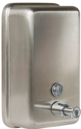
Vertical Soap Dispenser Code: ML605AS_N