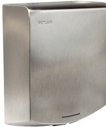
Eclipse Slimline Auto Hand Dryer Code: ML_ECLIPSE05_SS