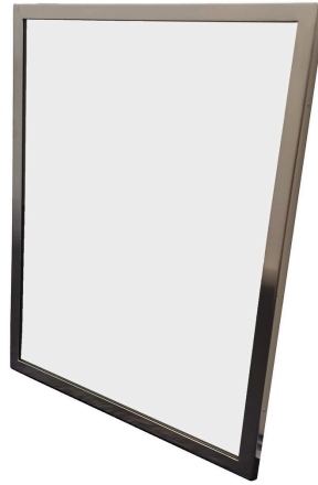
Framed Mirror Stainless Steel - 450mmW x 1000mmH