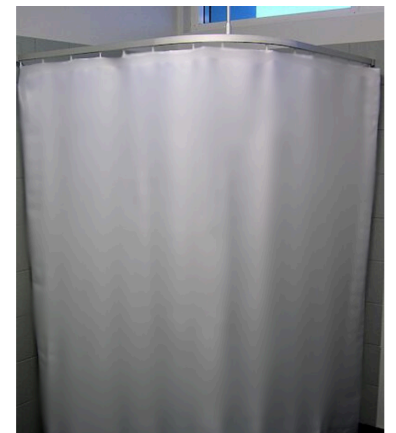
Polyester Taffeta Shower Curtain