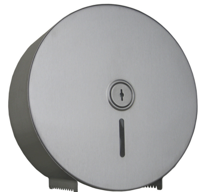
Jumbo Toilet Roll Dispenser Code: ML841