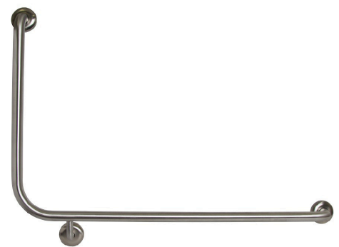
90° Flush Mount Side Wall RH Code: MLR104X_SS