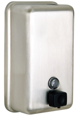
Vertical Soap Dispenser - Button Pump Valve Code: ML605BS_N