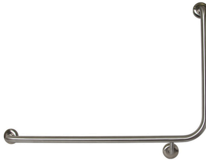
90° Flush Mount Side Wall LH Code: MLR103X_SS