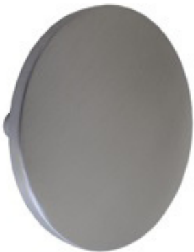
Bolt Through Hand Rail Fix Plate Code: MLRBT_FXPLATE