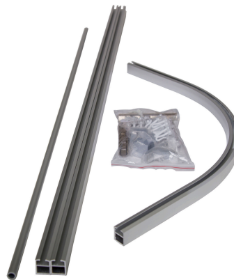
L Bend Modular Shower Curtain Track System