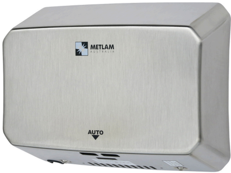
Eco Slender SS Code: ML_ECOSLENDER05_SS