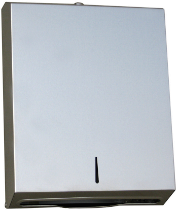
Paper Towel Dispenser - Stainless Steel