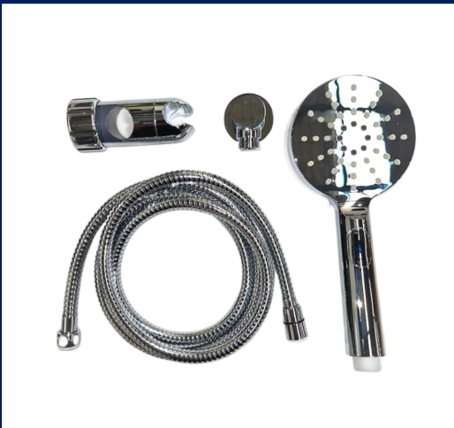
32mm 3 Function Shower Kit Code: ML_HSK_CHROME