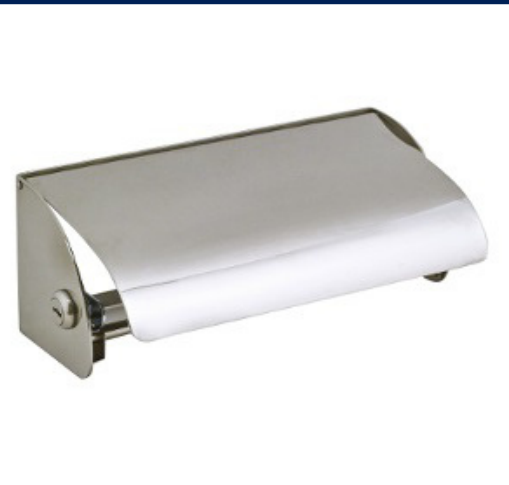
Double Toilet Roll Holder Lockable Code: ML267PSS