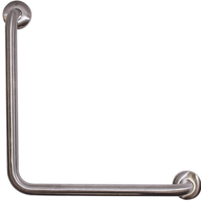
90° Ambulant Grab Rail Code: MLR112_SS