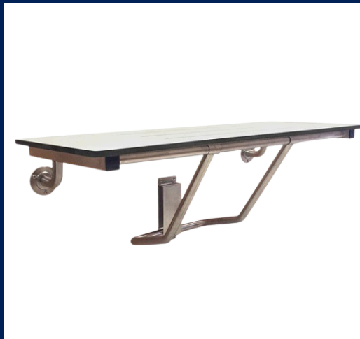
Accessible Folding Shower Seat Phenolic Code: ML994_PH